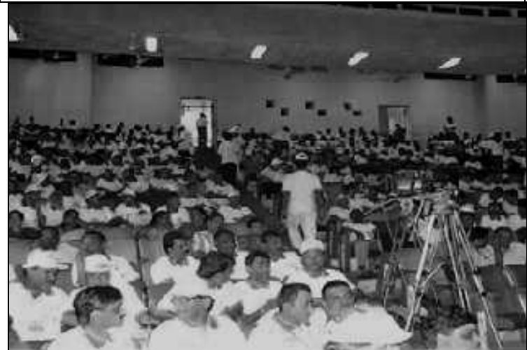
Delegates in uniform Dress code