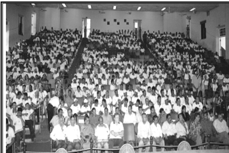
Full pack house at Valedictory function at Tagore Theatre