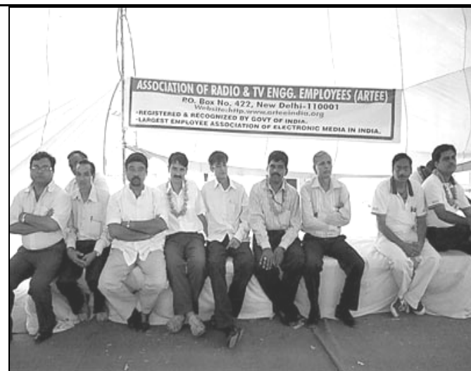
Moral Support . . .