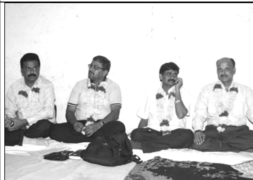
Leaders form Mumbai(WZ) sitting on hunger strike