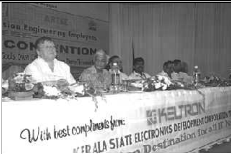
Member(P), E-in-C (AIR), Dy.GS UNI and others