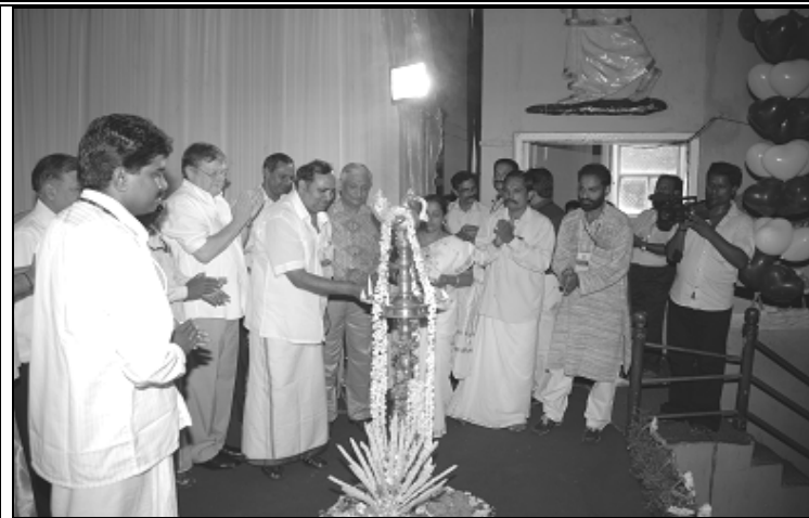
Lighting lamp on the inauguration of 16 th National Convention