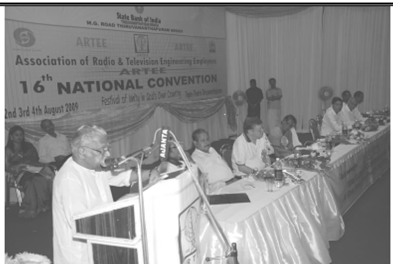
Sh.V.S.Achuthanandan, Hon'ble CM Kerala inaugurating the Valedictory function on 4 th August 09.